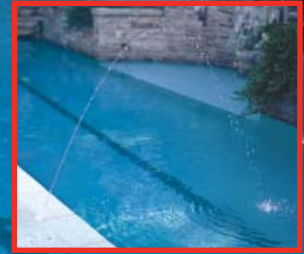
Single 3/8" stream