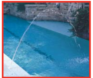
Single 5/8" stream