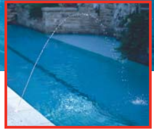
Single 1/4" stream